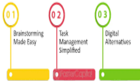
Fig.2 Enhancing Team Collaboration with Modern Project Management Tools,Source([2])

This paper aims to analyze the impact of modern project management tools on team collaboration and productivity. The study evaluates various tools, including Asana, Trello, Jira, and Microsoft Teams, to determine their effectiveness in enhancing teamwork and ensuring project success.