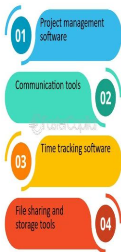
Fig.1 Team Collaboration

Through a review of existing literature and statistical analysis, the study evaluates the effectiveness of these tools in various industries. The findings indicate that the