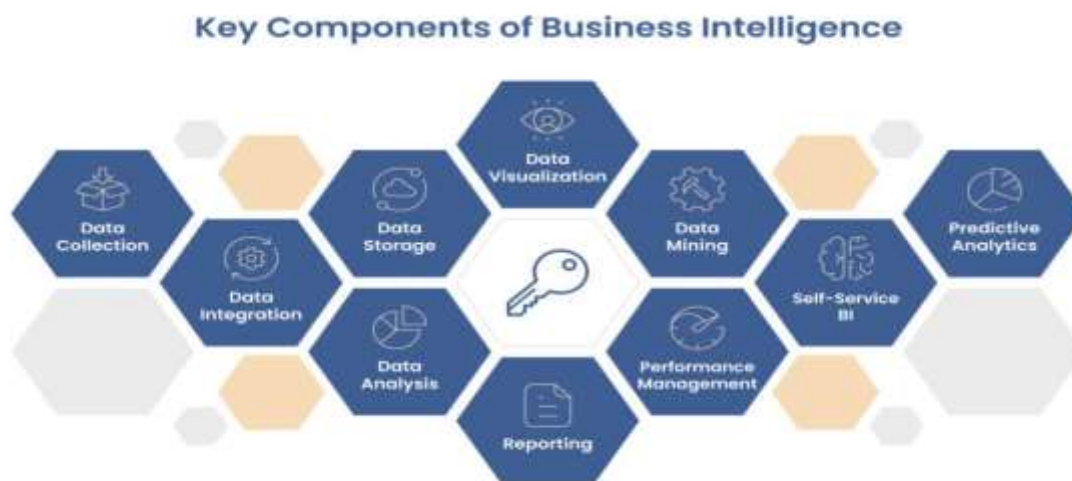
Figure 1: Key components of BI

The concept of Business Intelligence has evolved over the past few decades. Originally focused on reporting and querying, BI now encompasses a broad range of data analysis tools, including predictive analytics, data mining, and machine learning. Its applications in store operations have grown, with significant attention given to its role in improving operational processes, increasing revenue, and reducing costs.